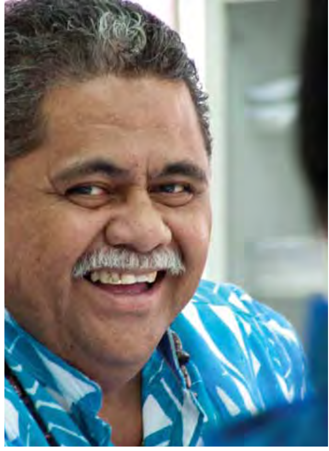
BRIGHT FUTURE: Samoa's Legislative Assembly is building its capacity, led by the Speaker the Hon Laauli Leuatea Polataivao Fosi Schmidt

"I think the sort of work that's being done between the parliaments gives a real opportunity for the Samoans to learn